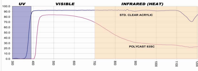
2515 vs. SC15